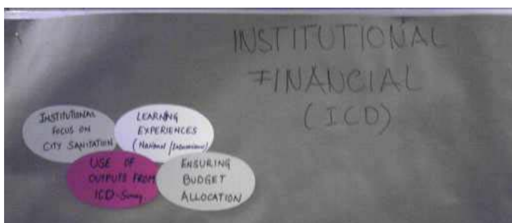
Fig 3: Group discussion on Institutional and financial Issues and usage of the ICD tool

Ensuring budget allocation for sanitation issues, definition of clear roles and responsibilities under the institutional focus on city sanitation, learning experiences from other national and international experiences are key issues that have to be addressed/included in the CSP. GTZ suggests to facilitate the process of the “Use of Outputs” from the “Integrated City Diagnosis” tool with support from the consultants.