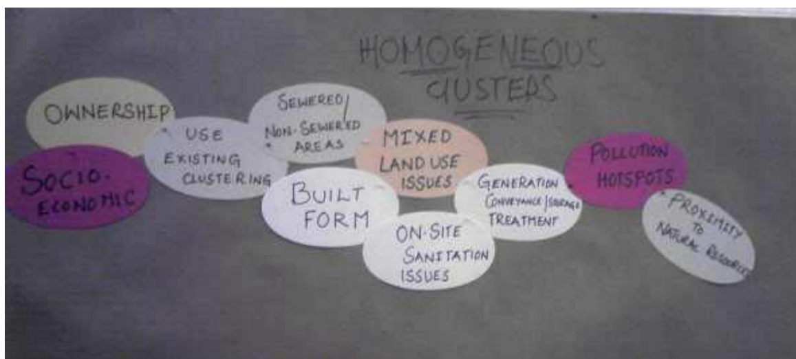
Fig 2: Group discussion on Homogeneous Clusters

Since comprehensive city-wide analysis of the current sanitation and proposals for improving sanitation is not possible within the given time frame, it was decided that the CSP exercise will follow a clustered approach. The idea of clustering is to identify those areas/wards/locations within the city with similar issues, which can be equally dealt with in the recommendation. However it was found during the discussion that the boundaries for a cluster could be defined differently such as: (a) land ownership, (b) socio-economic factors, (c) built-form, (d) natural boundaries (urban watersheds), (e) sanitation infrastructure, (f) landuse or (f) pollution hotspots. The consultants will identify and define the clusters/boundaries in each city individually. The justification for defining these clusters will be elaborated in the CSP.