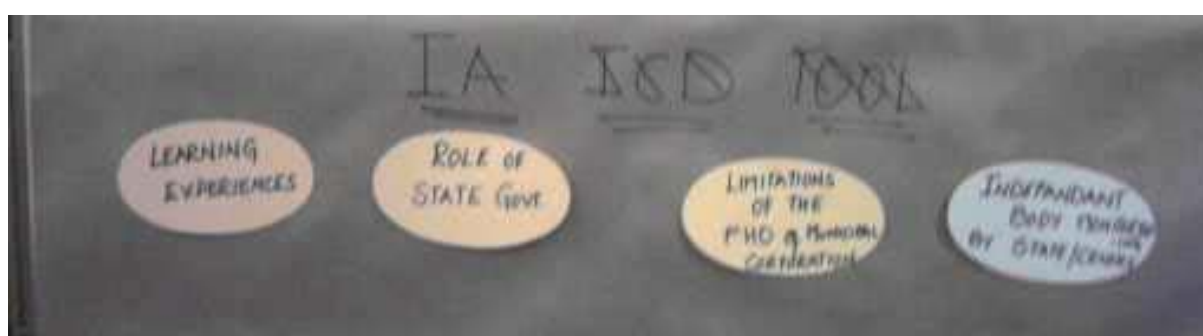
Fig 4: Group discussion on Implementation Agency for CSP

It is decided that the consultants should review the role of the state government (under sanitation), limitations of the public health department of the MC and other best practices prior to their discussions with the MC’s regarding the “Implementation Agency” of the CSP. It was also suggested that an independent body commissioned by the state or the central government can be the implementation agency for the CSP.